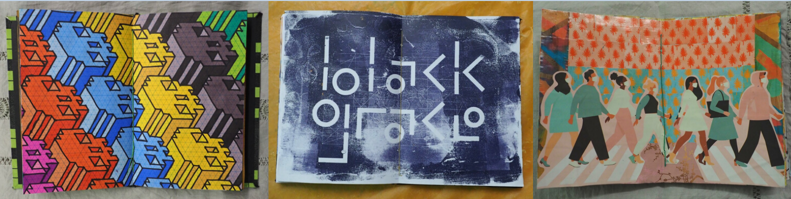
Sample pages made by students in our Art Journaling for Beginners class