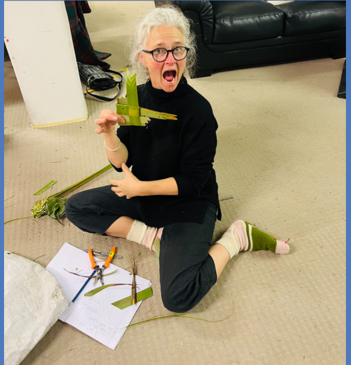
A very happy Raranga student!