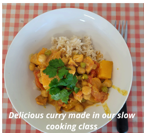
Delicious curry made in our slow cooking class