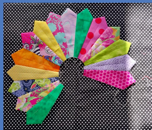
Right: Progress in Dresden Plates class