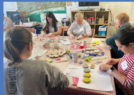
Our cookie decorators had a great time, and produced some gorgeously edible results