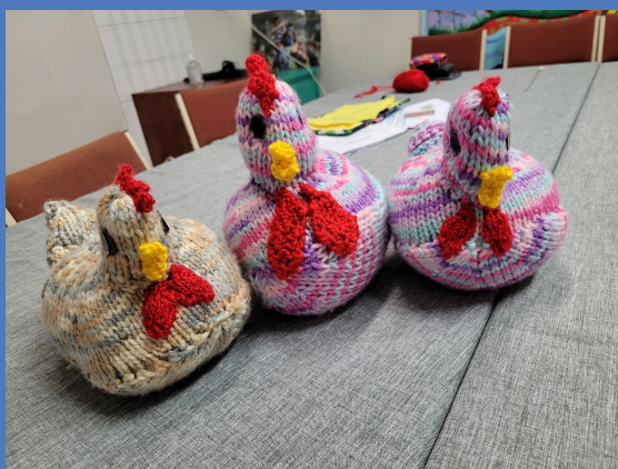
Left: Knitting class hens