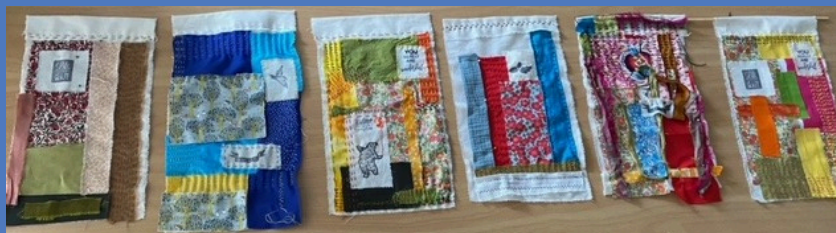
Happy Hangers class work