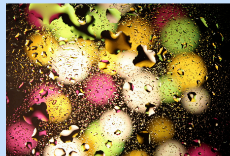
Plenty of experimenting at the photography class this term