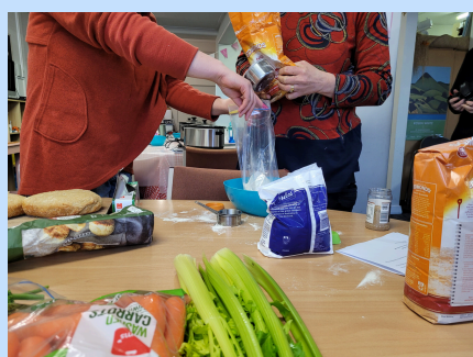
Delicious recipes in progress in our slow cooking class