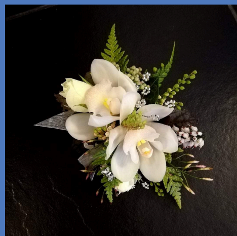
Left: Elizabeth at work with floral creations. Right: Examples of Elizabeth's work