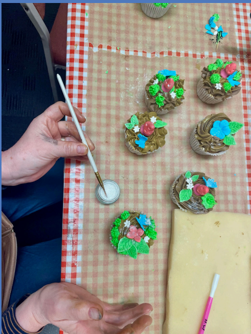
Left: Deliciously decorated cupcakes in progress Right: T3 Raranga class