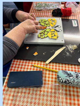
Amazing work in our Winged Insects Mosaic class