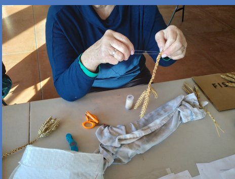
Lovely work produced in Heritage Straw Weaving