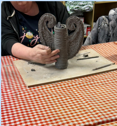
Work in progress from our ceramic and mosaic totem sculpture class