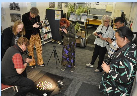
Students from our Photography: Getting Started class, enjoying their work