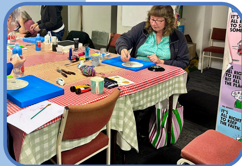
Textured Acrylic - Student work