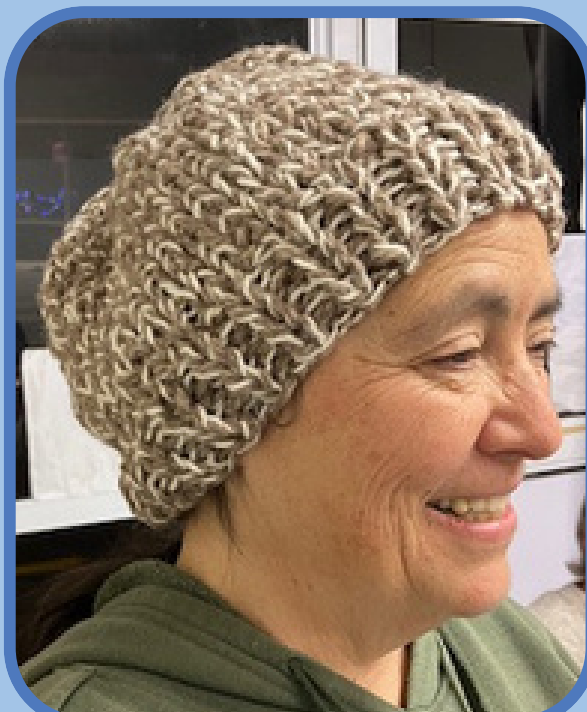
Beginners Knitting-Student work