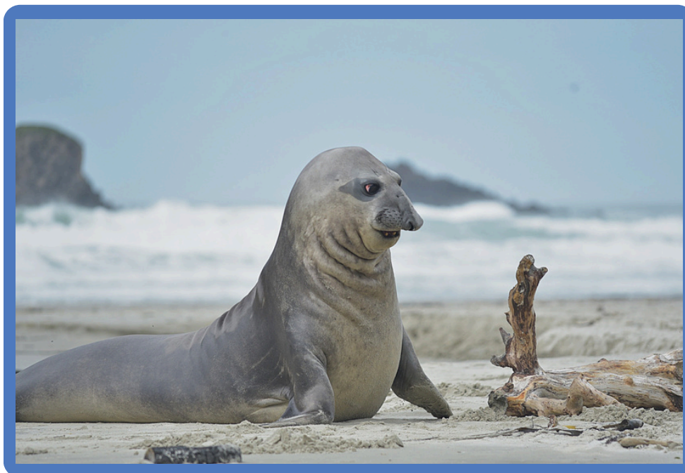
Adults Wildlife Category - Paul Donovan - Finalist - 2026 Tūhura Photography Exhibition

Inspired by what you see? Paul Donovan will be teaching Photography: Getting Started next term, offering students the chance to develop their own photographic skills under the guidance of an experienced and accomplished photographer. Places are expected to fill quickly, so keep an eye out on our website for enrolment details.