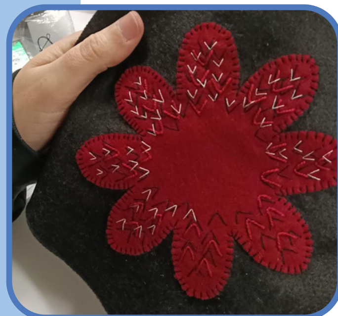
Modern Embroidery - Student work