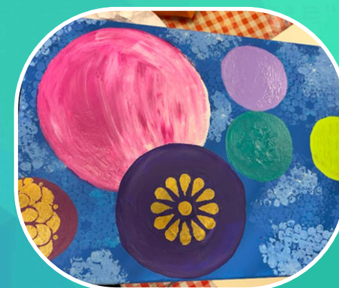
Textured acrylic Student work