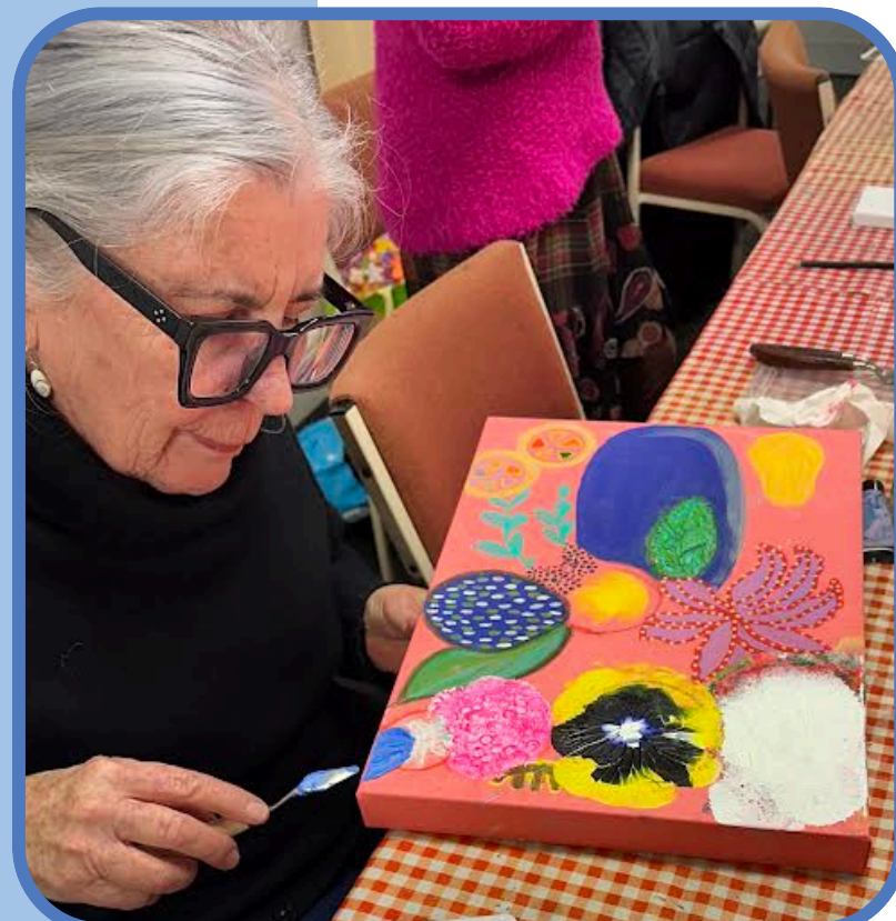
Textured Acrylic - Student work