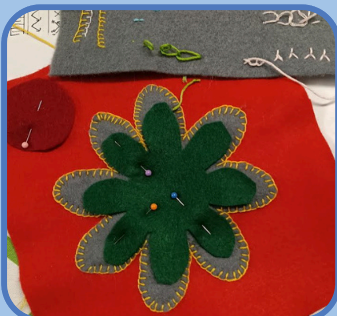
Modern Embroidery - Student work