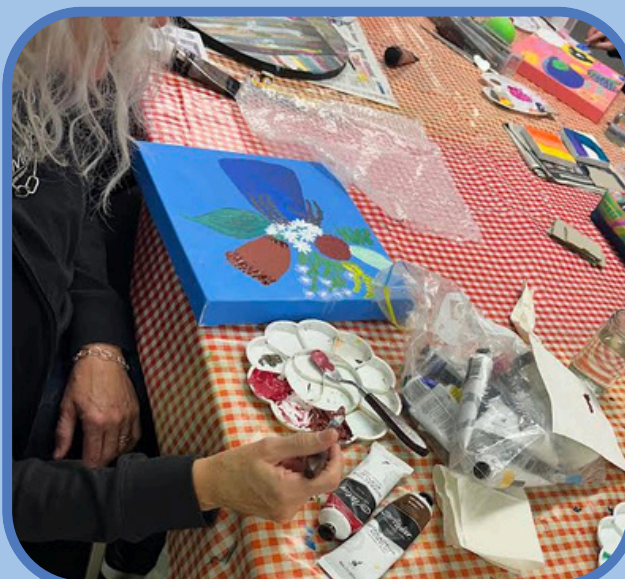
Textured Acrylic-Student work