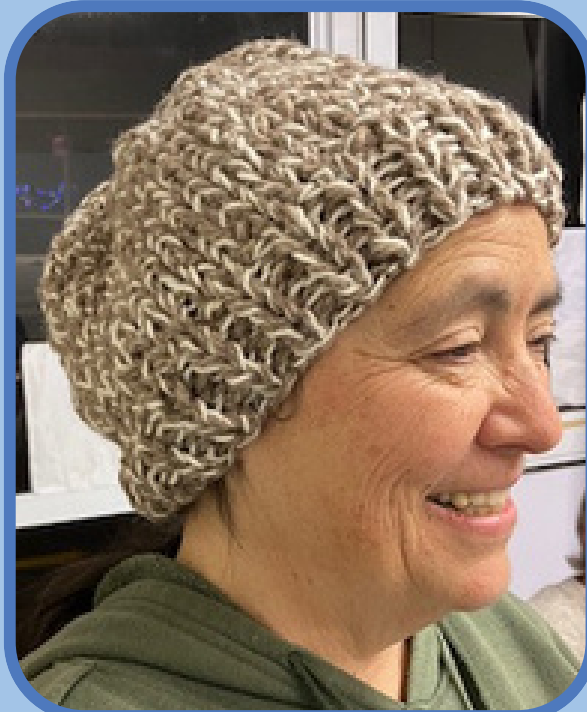
Beginners Knitting-Student work