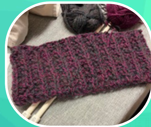
Beginners knitting Student work