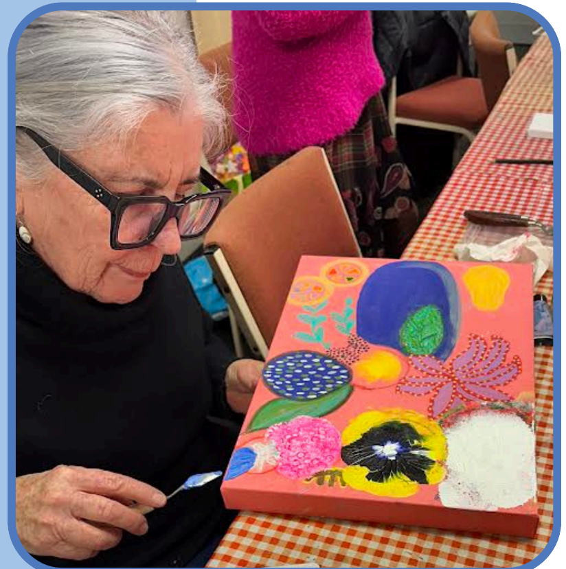
Textured Acrylic - Student work