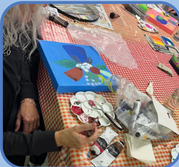
Textured Acrylic-Student work