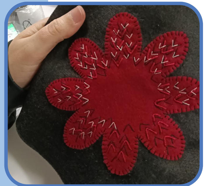
Modern Embroidery - Student work