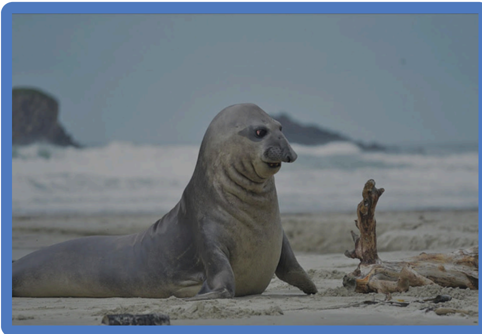
Adults Wildlife Category - Paul Donovan - Finalist - 2026 Tūhura Photography Exhibition

Inspired by what you see? Paul Donovan will be teaching Photography: Getting Started next term, offering students the chance to develop their own photographic skills under the guidance of an experienced and accomplished photographer. Places are expected to fill quickly, so keep an eye out on our website for enrolment details.