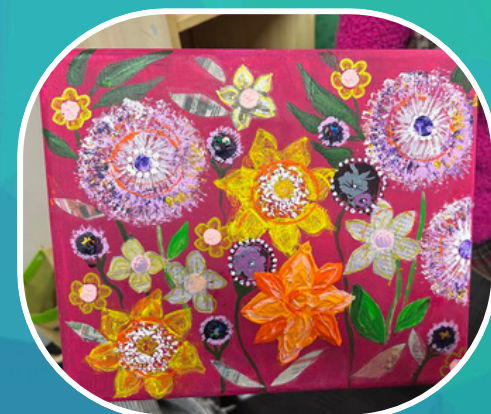
Textured acrylic Student work