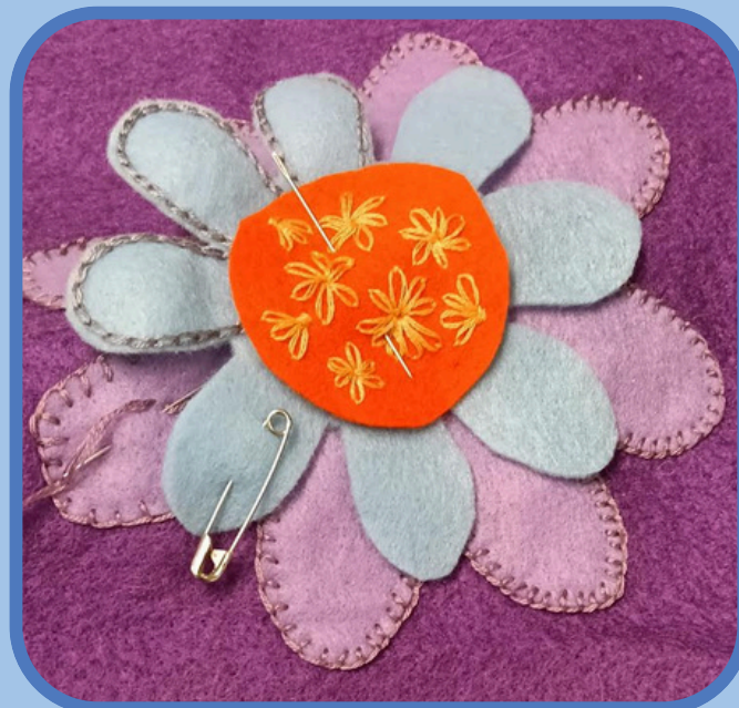
Modern embroidery - Student work