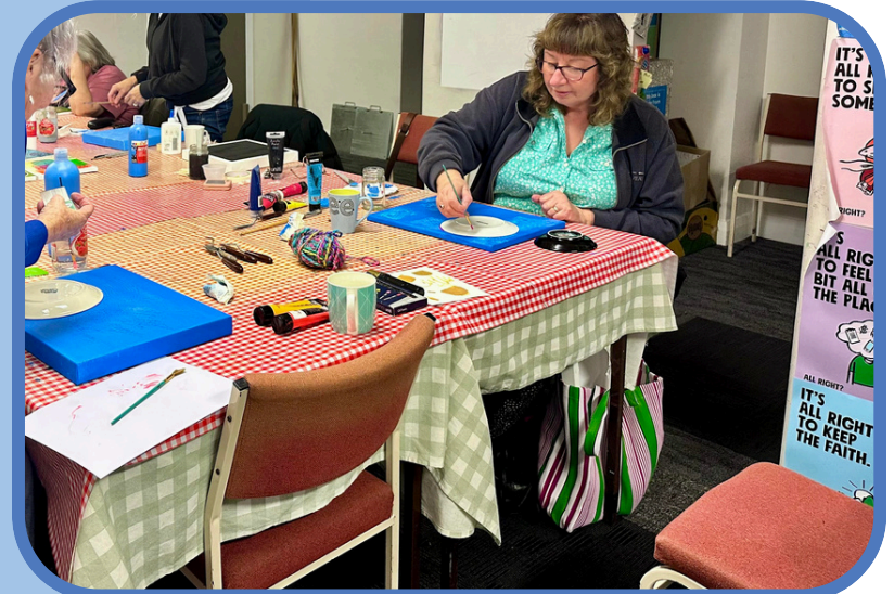
Textured Acrylic - Student work