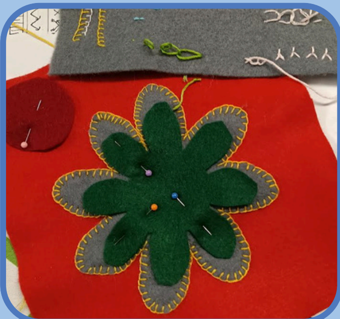
Modern Embroidery - Student work