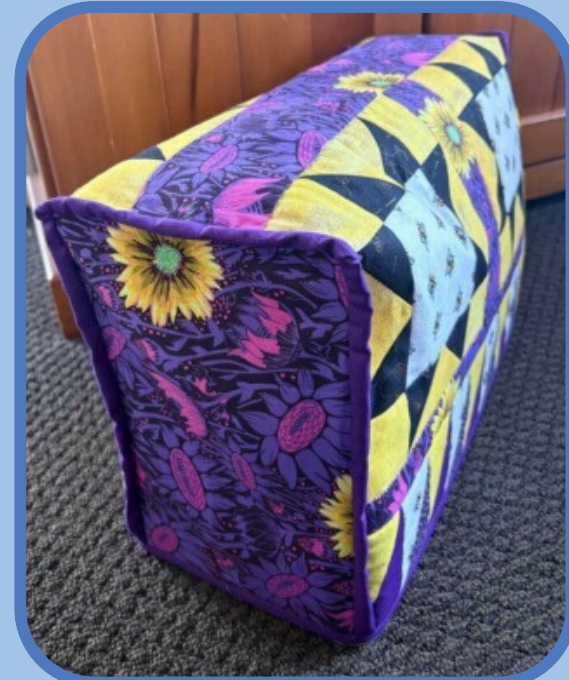
Wrangling the Ruler-Student work