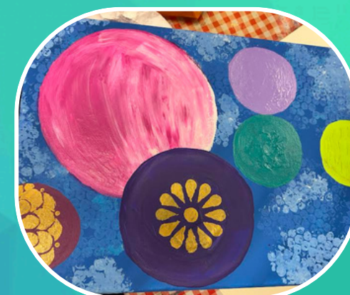
Textured acrylic Student work