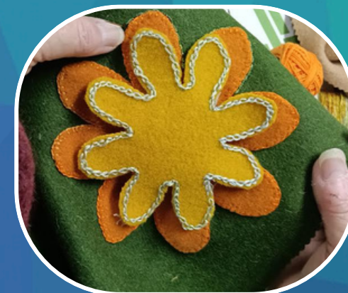
Modern embroidery Student work